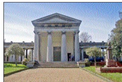
The Anglican Chapel