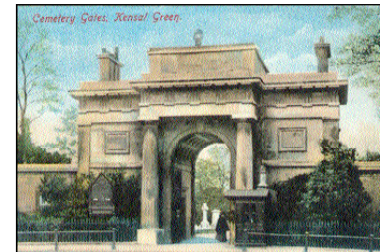
The Main Gate c.1905

Kensal Green Station (Bakerloo Line) Harrow Road NW10 5JT